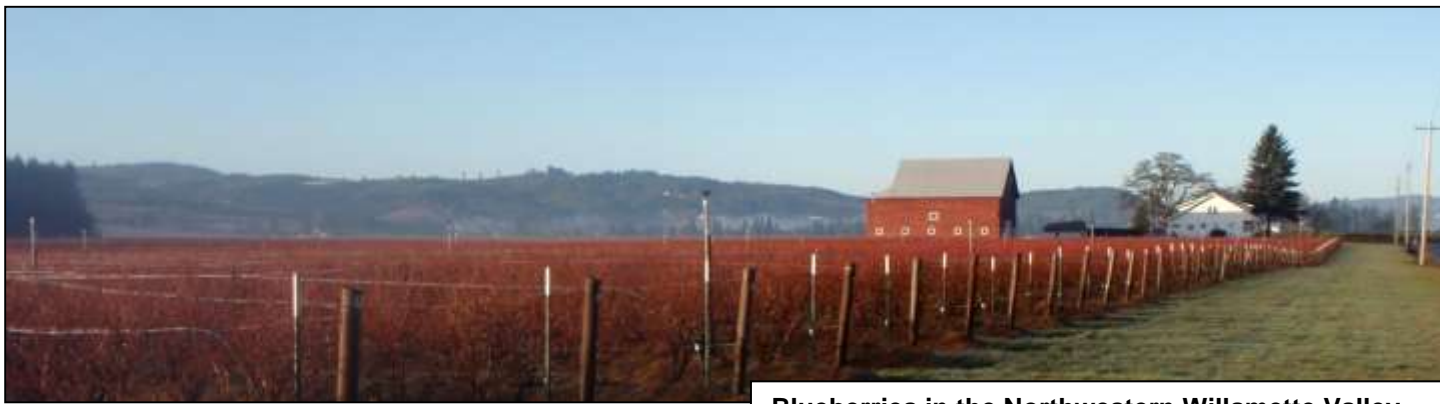
Blueberries in the Northwestern Willamette Valley